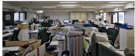
Figure 1: The former office of UDS Ltd.

We here show the case of designing a new workplace for UDS Ltd. This is a Japanese company that supports community development by designing houses, offices, and hotels. Figure 1 show the former office of UDS Ltd.