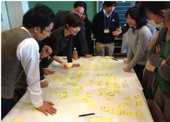
Figure 2: Future mining for new UDS office

want to work with a feeling that it is easy to get together like music, art, or Physical Education class.”